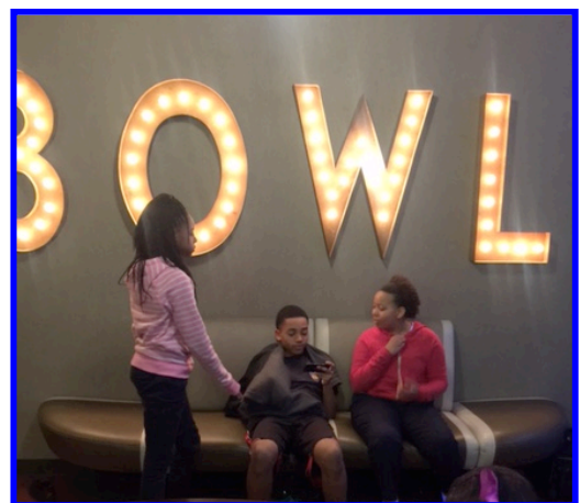
Exercise to keep the body fit. CLS teaches wholeness in living for Christ.