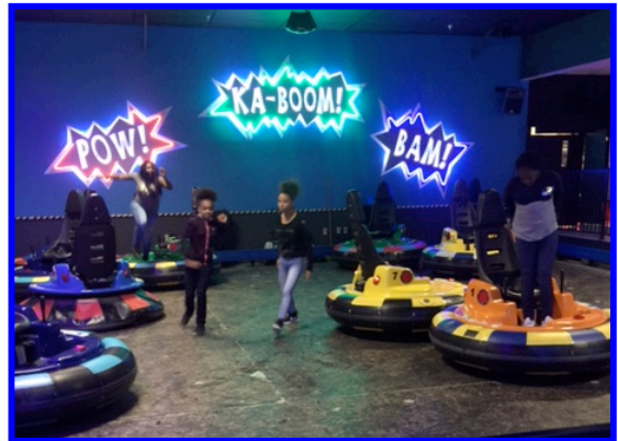
Good clean fun for youth at CLS outing