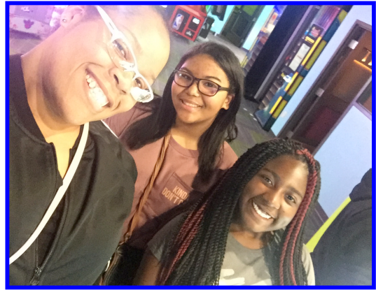
Current enrollees in Christian Life Skills at Union Baptist Church